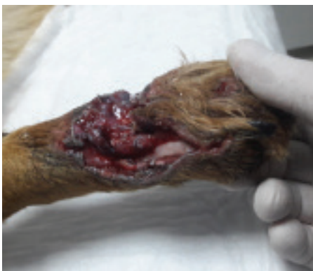
Day 1 (Before Treatment)

The reconstructive surgery was successful. The wound was irrigated with Maxi-Wash™ 2-3 times daily prior to each dressing change. Despite an unfavorable forecast of the treatment of acute traumatic lacerated injury of the hind limb, the dog experienced almost complete healing on the 17th day. Animal made complete recovery.