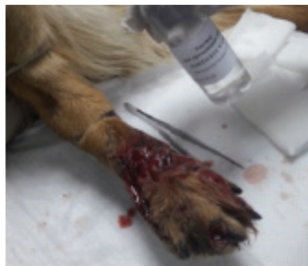
Day 1 (After Treatment)